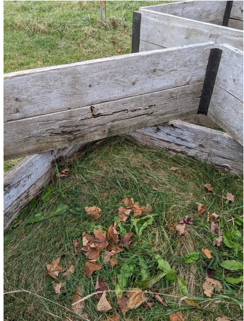
Donated raised beds needing new wood panels