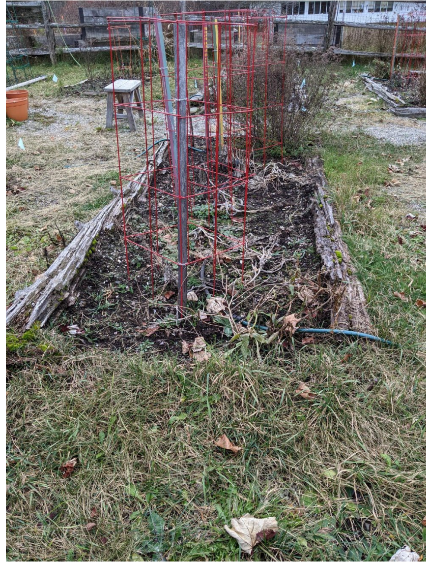
Deteriorated garden bed