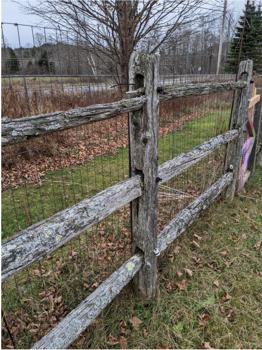
Deteriorated garden fence