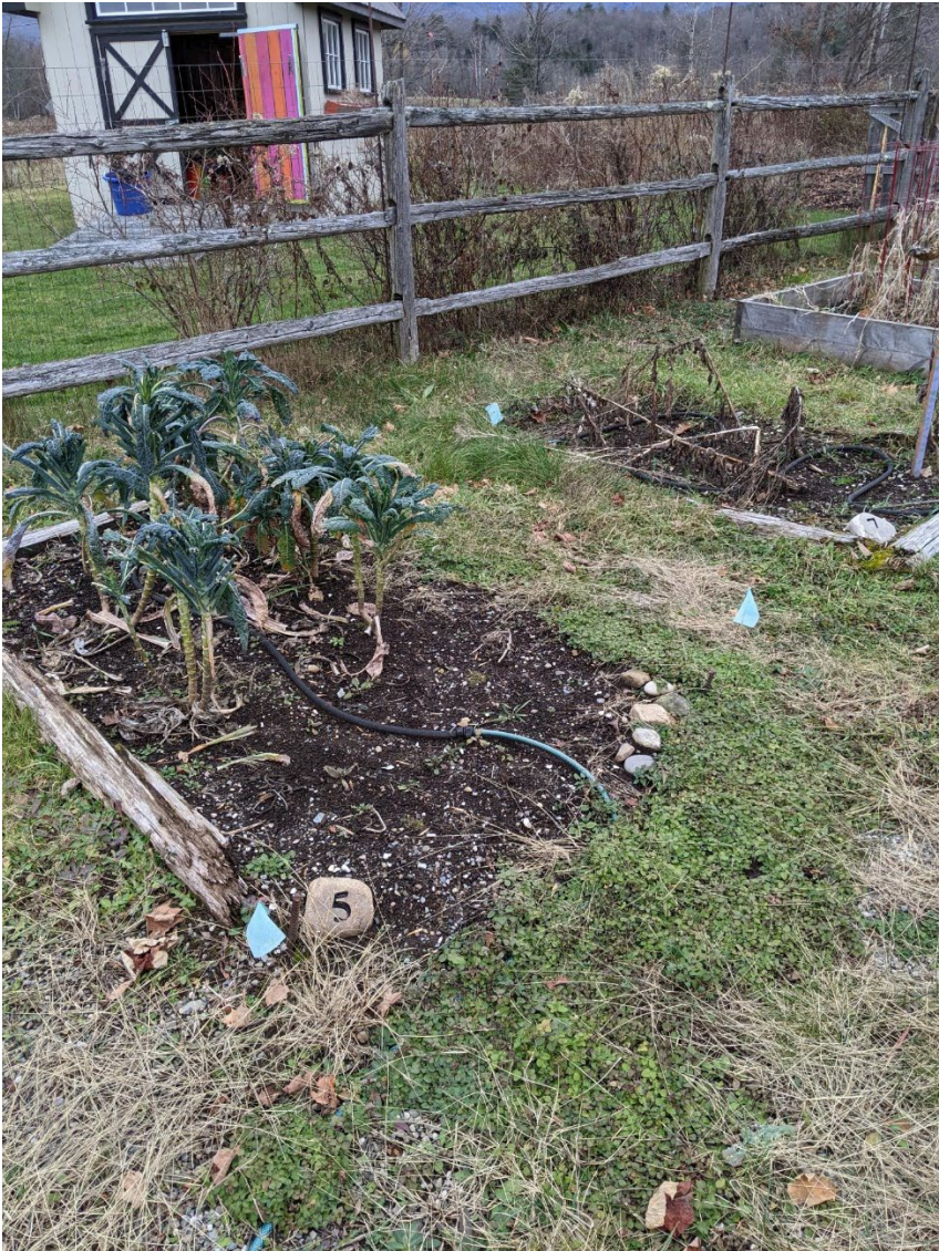
Deteriorated garden bed