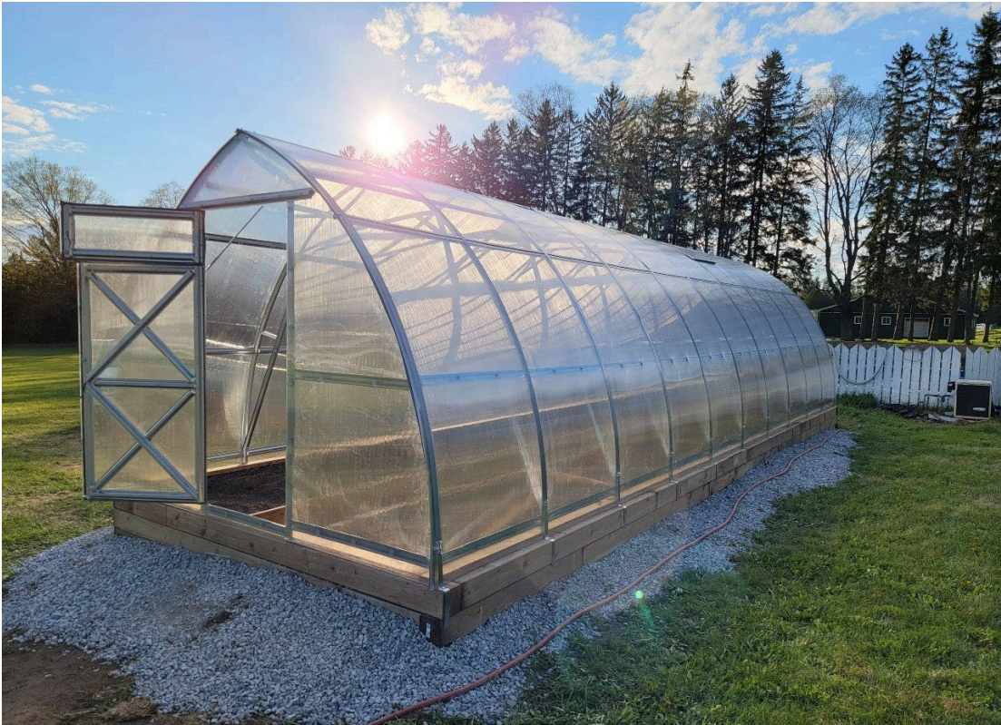
Hoop house with base