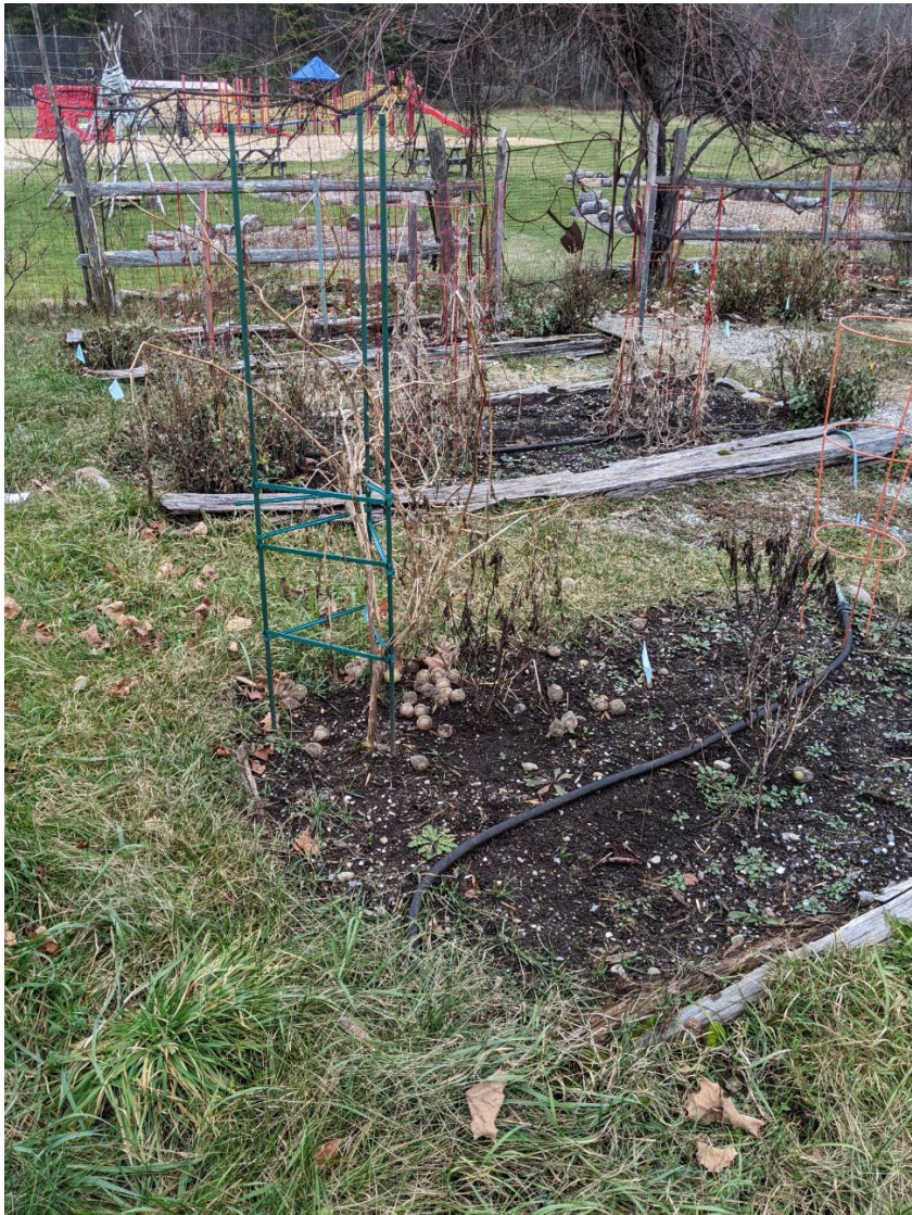
Deteriorated garden bed