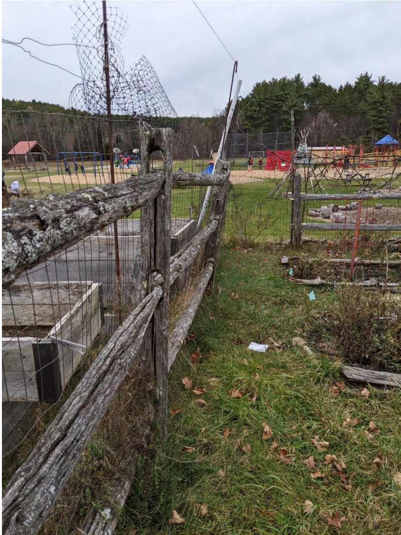
Deteriorated garden fence